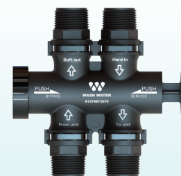
EaSi-Fit Bypass – up to 80 lpm. Supplied with speedfit connections for both 15 and 22mm pipework.